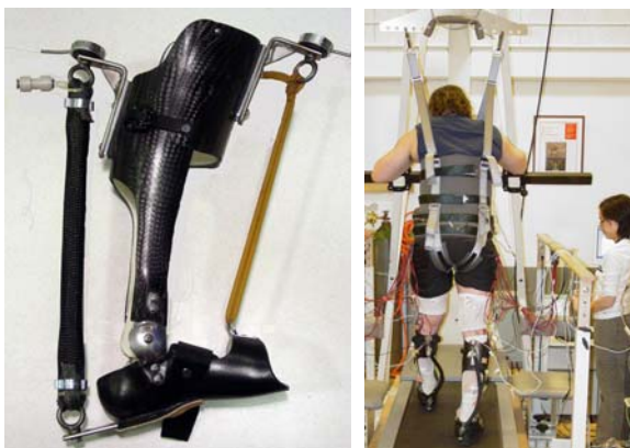
Figure 1: (a) Powered Ankle-Foot Orthosis (AFO). A lightweight carbon fiber orthosis (~1.5 kg) fit with an artificial pneumatic plantarflexor muscle. (b) Therapist Control. A therapist uses push-buttons to control the timing of active AFO assistance at the ankle as an ASIA D 24 yr. old male trains with partial body weight support.

Four subjects (ASIA C or D) with chronic incomplete spinal cord injuries walked at 0.54 m/s under three different conditions: (1) without the AFOs, WO ; (2) with passive bilateral AFOs, PA ; and (3) with active bilateral AFOs under push-button control by a therapist, TC . Body weight support was provided at either 30% or 50% depending on the weight-bearing ability of the subject. When necessary, elastic cords provided lateral stability.